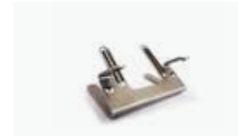
Holder for Pulswave Handpiece Cod. 50ME.PM-PW