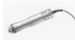
Pulswave handpiece cod. 20MAN.PULSW