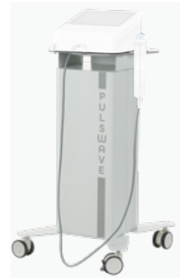
PLUS trolley (Pulswave version) cod. 30CL.PLS-S 516 x 516 x 840 mm