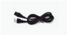
Power cable cod. CV/1