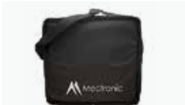
Flex Bag NYL Cod. 30BO.F-MM