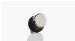
Large applicator cod. 20AP.PW-G Ø 24 mm